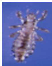
young louse (nymph)