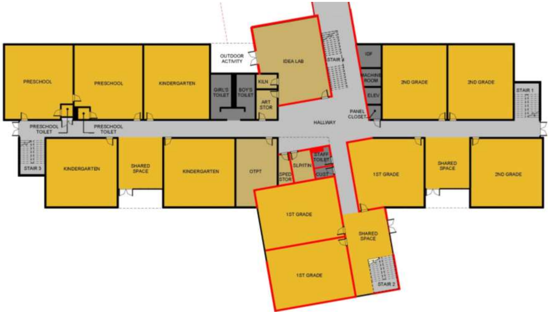
Core Academic Area