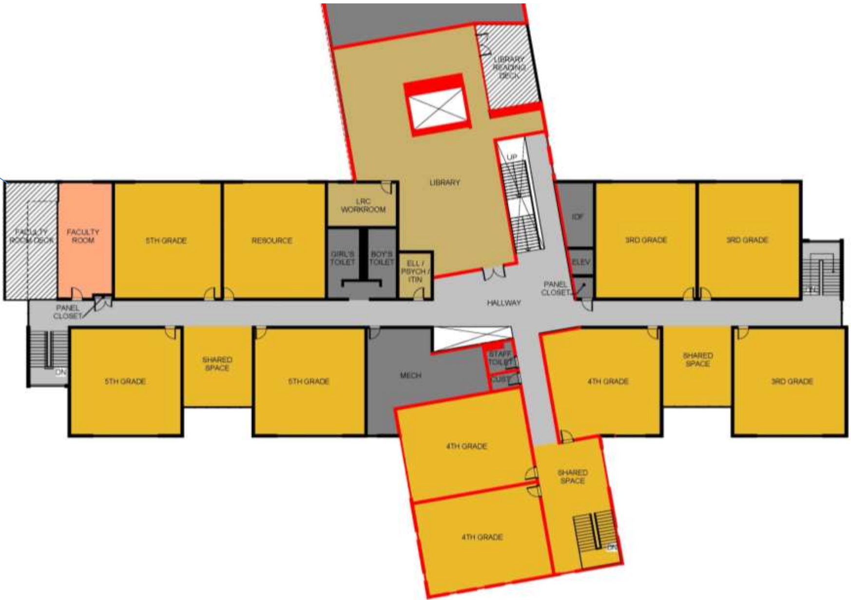
Core Academic Area