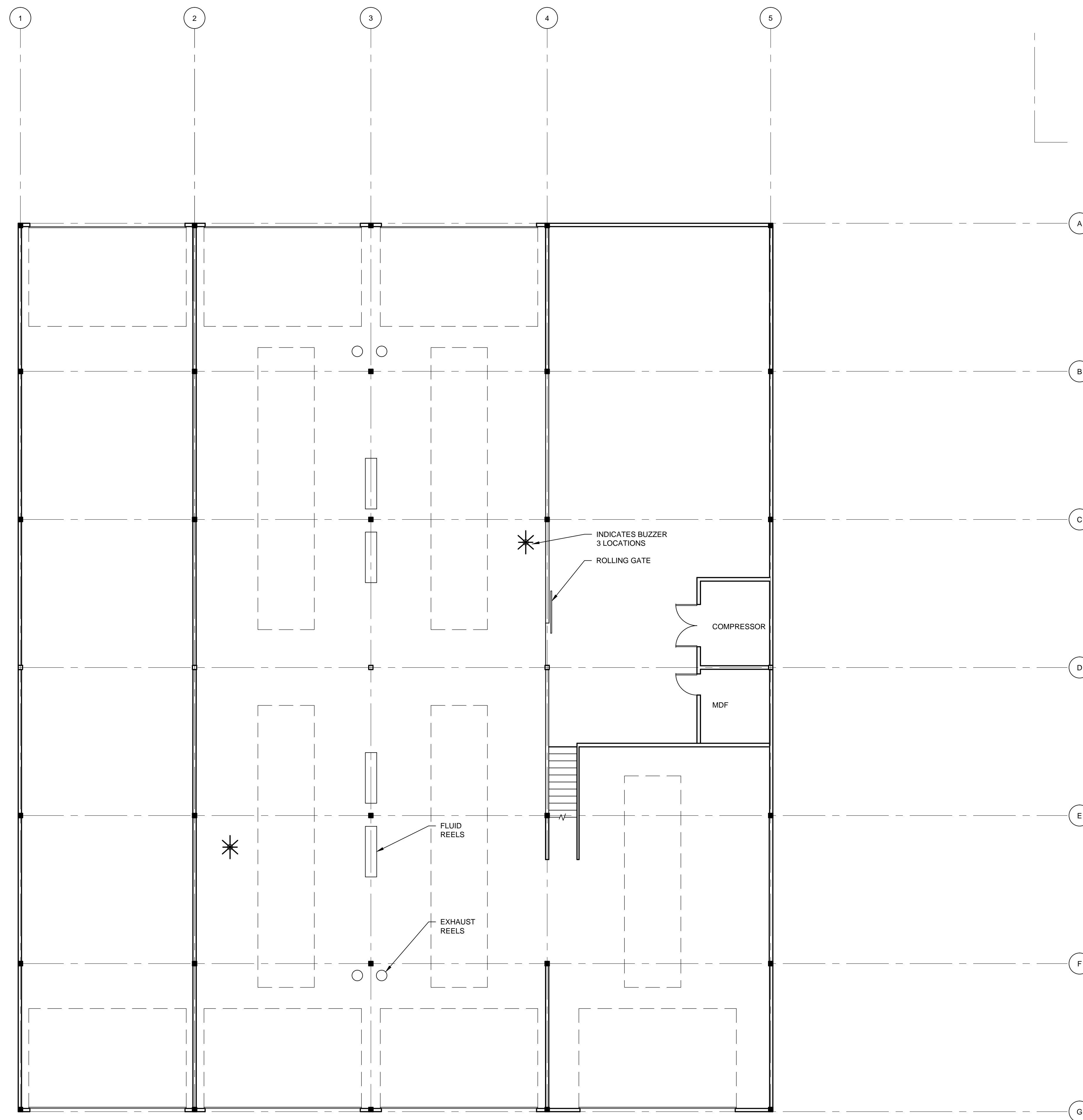
1 UPPER LEVEL PLAN 1/8" = 1'-0"

ARCHITECTURE | INTERIOR DESIGN zervasgroup.com 209 Prospect Street Bellingham, WA 98225 360.734.4744