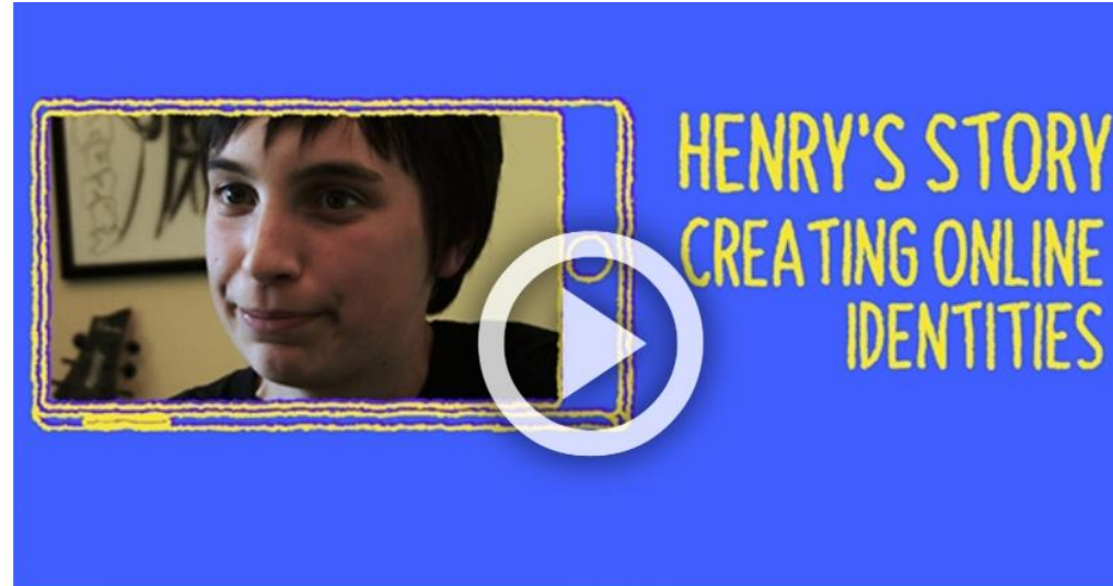
Henry's Story- Creating Online Identities

Students learn that presenting themselves in different ways online carries both benefits and risks. Students first consider what it means to adopt a different identity online. Next, they watch the video, “ Henry’s Story – Creating Online Identities ,” and discuss their responses to the different ways Henry presents himself to others on the Internet. Students complete the Take a Stand Student Handout , where they explore the ethics of exaggerating, deceiving, or adopting a different identity online. They complete the lesson by reflecting on the choices they make when they present themselves in different ways online, and the benefits and risks involved in doing so.